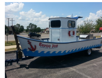
Everyone will Love the "Bayou Joe" Shrimp Boat